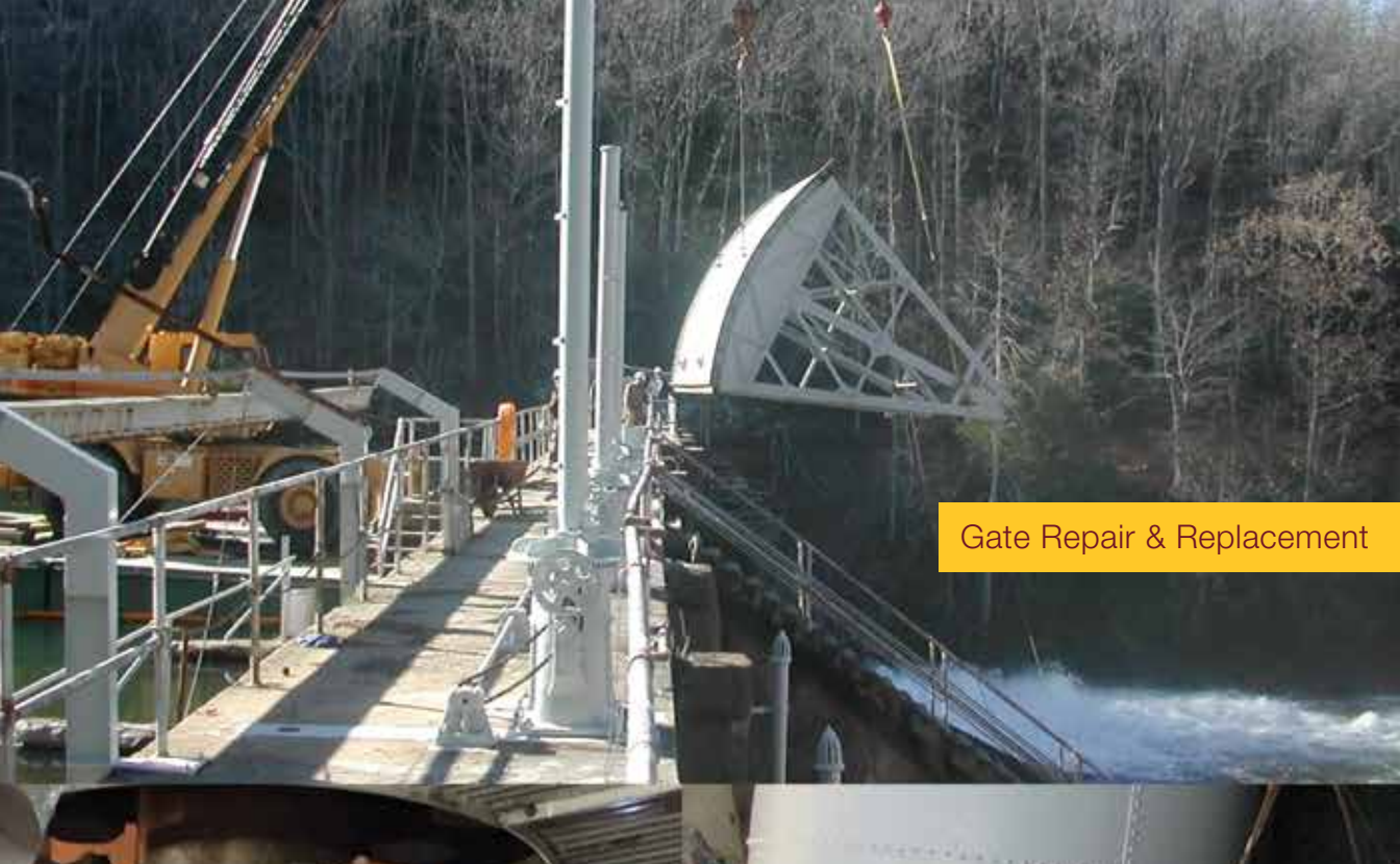
Gate Repair & Replacement