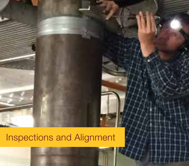
Inspections and Alignment