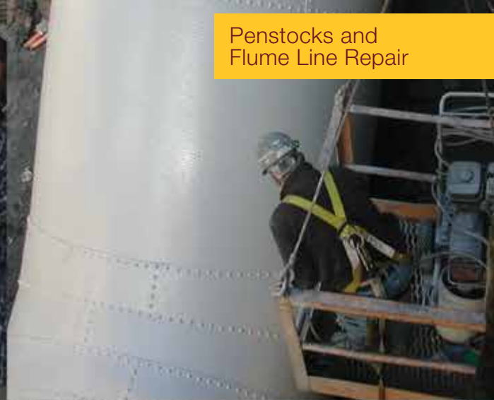
Penstocks and Flume Line Repair