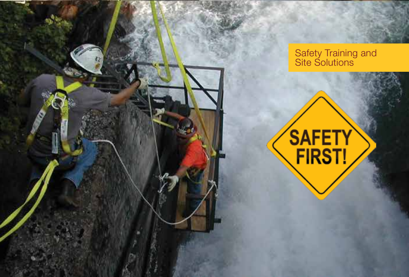
Safety Training and Site Solutions