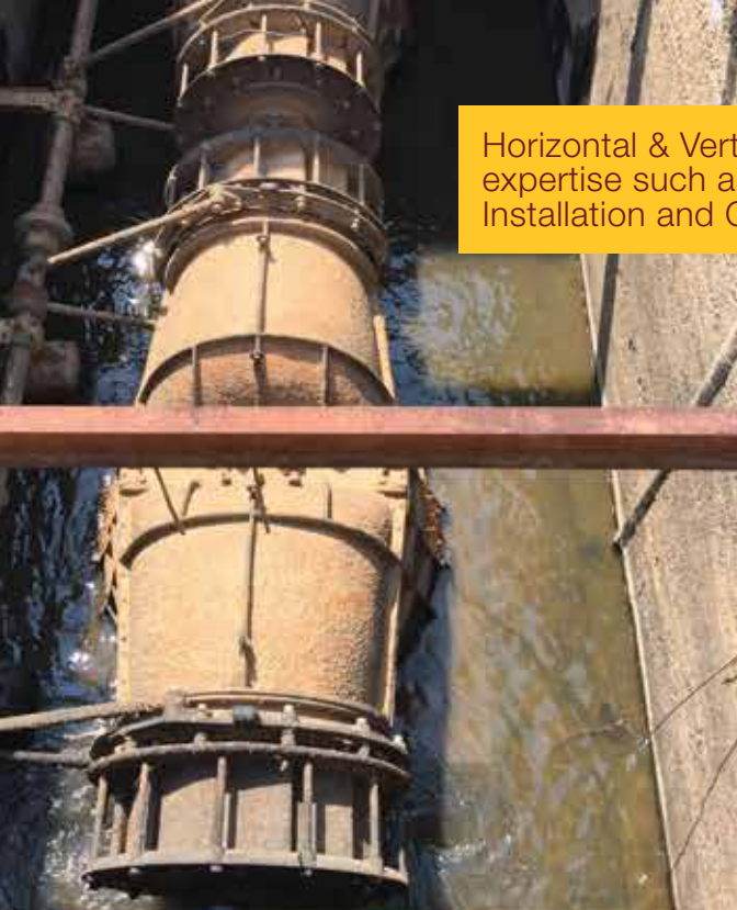
Horizontal & Vertical Turbine expertise such as Rotor Pole Installation and Cavitation Repair