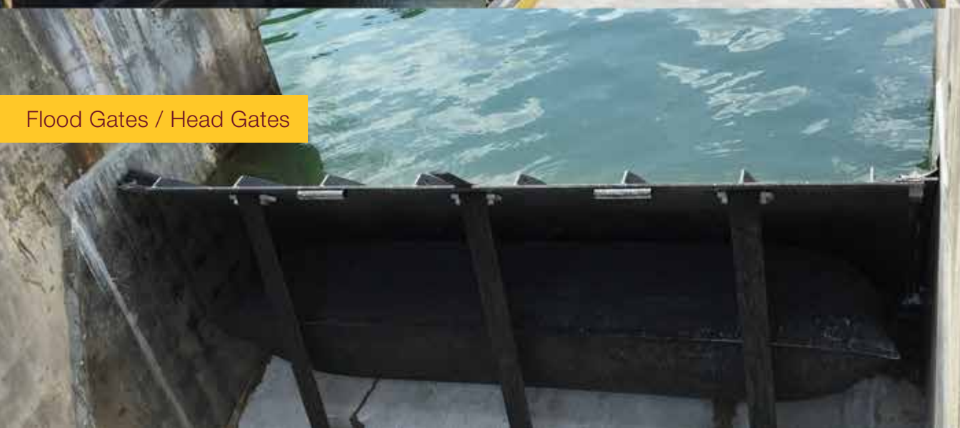
Flood Gates / Head Gates