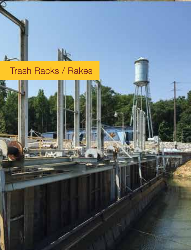
Trash Racks / Rakes